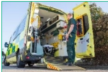
Paramedic Emergency Service