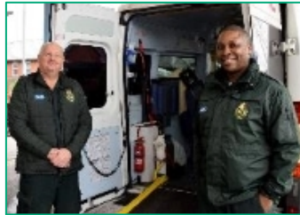
*Patient Transport Service